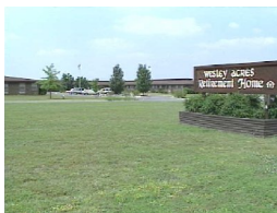
Wesley Acres & WA II

Wesley Acres & Wesley Acres II—Decatur, AL 700 Cedar Lake Rd SW #501, Decatur, AL 35603 / (205) 355-8281 120 HUD-assisted independent living units