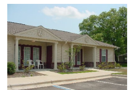
Wesley Scott Place

Wesley Park Apartments—Anniston, AL 1405 Crane Avenue, Anniston, AL 36201 / (256) 741-8666 56 rent-restricted independent living units