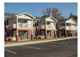
Wesley Park Apts.

The Epworth House—Selma, AL 2500 Franklin Street, Selma, AL 36703 / (334) 875-6450 48 HUD-assisted independent living units