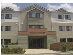
The Epworth House

Wesley Glen—Decatur, AL 700 Cedar Lake Rd SW #501, Decatur, AL 35603 / (256) 355-8281 55 rent-restricted independent living units