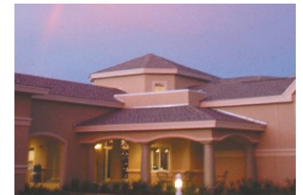
The Haven: Our Lady of Peace A Partnership Managed by Sacred Heart Health System

Wesley Haven Villa—Pensacola, FL 111 E. Wright Street, Pensacola, FL 32501 / (850) 434-1035 Assisted living and affordable housing services