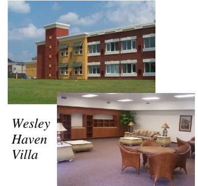
Wesley Haven Villa

Wesley Gardens—Montgomery, AL 1555 Taylor Road, Montgomery, AL 36117 / (334) 272-7917 Assisted living and specialty care assisted living for the cognitively impaired